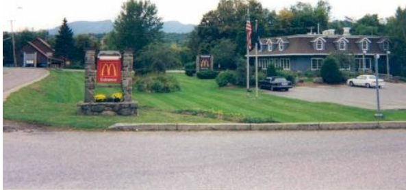
Two examples of McDonald's restaurants that were designed to respect the local character: This Plan encourages architectural elements that deviate from conventional brand archetypes, and developments that utilize site design approaches which hide parking lots behind buildings and landscaping.

The Township Zoning Ordinance specifies uses within the Manufacturing/Commercial future land use designations shown on Map 5. Generally, these include professional offices, light manufacturing and research facilities, and retail businesses. These uses will not be disruptive to residents and natural resources under this Master Plan.